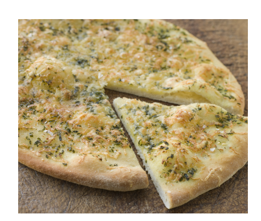
Plain Garlic Bread (V) 6 Cheesy Garlic Bread (V) 7