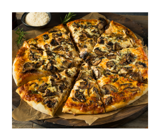
10.50 Mushroom Magic (V) 9.50

tomato sauce, mozzarella, pepperoni, fresh chillies