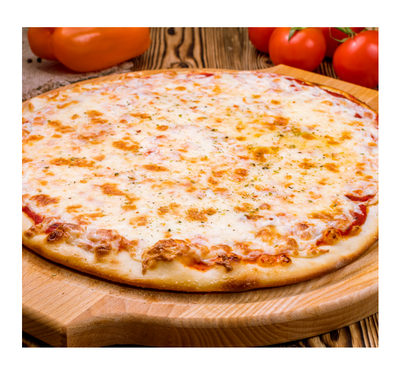
Margherita (V) tomato sauce, mozzarella