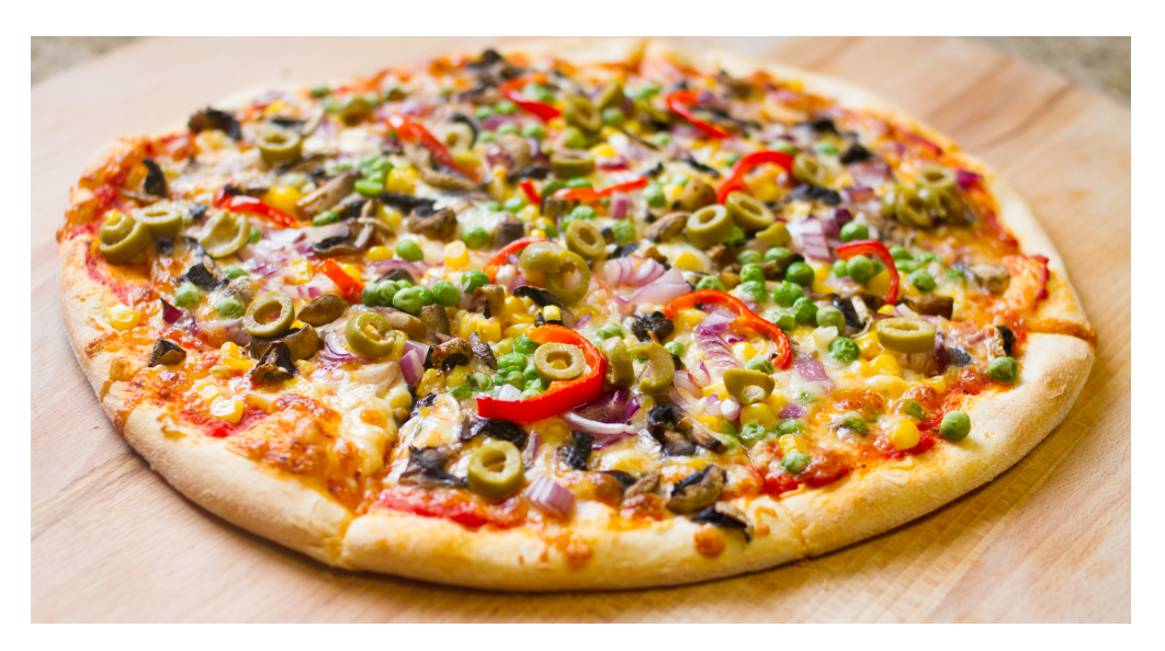
Vegi Heaven (V)